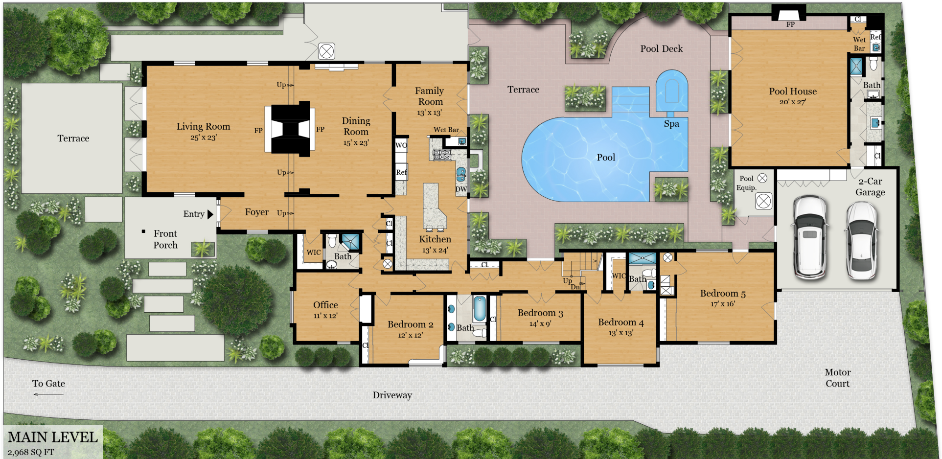
MAIN LEVEL 2,968 SQ FT